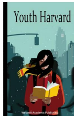
Non-Fiction, New Releases Youth Harvard