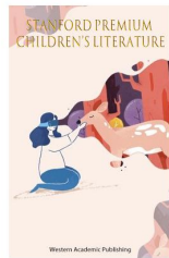
Fiction, New Releases Stanford Premium Children's Literature

Writing English is an fundamental foundation of international communication and cultural exchange. As such a students writing ability is considered to be one of the most comprehensive presentations of one’s proficiency in English. In order to better motivate students, as well as cultivate and discover those who exhibit talent in English learning and in writing, FamousEdu is currently co-hosting the 2019 Western Academic Publishing (WAP) International Youth Writing Activity together with the Western Academic Press. We are now calling for submissions for articles for the following three books.