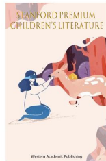
Fiction, New Releases Stanford Premium Children's Literature

鉴于英语写作是国际交流与文化传播的重要手段，而写作能力是中学生英语语言能力与人文素养的综合展现，为了进一步深化中学英语教学改革，提高全国高中生的英语应用能力，培养和发现优秀的英语全面人才，FamousEdu 现与 Western Academic Publishing WAP（简称 WAP）西方学术出版社共同举办 2019 年 WAP 海外青少年文学中国区征文活动，并针对以下三本书籍，积极完成期刊征稿及普惠工作