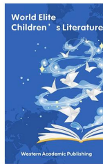
Fiction, New Releases World Elite Children's Literature