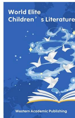
Fiction, New Releases World Elite Children's Literature