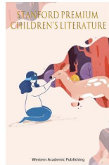
Fiction, New Releases Stanford Premium Children's Literature

Writing English is an fundamental foundation of international communication and cultural exchange. As such a student's writing ability is considered to be one of the most comprehensive presentations of one's proficiency in English. In order to better motivate students, as well as cultivate and discover those who exhibit talent in English learning and in writing, CTVE is currently co-hosting the 2019 Western Academic Publishing (WAP) International Youth Writing Activity together with the Western Academic Press. We are now calling for submissions for articles for the following three books.