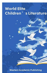
Fiction, New Releases World Elite Children's Literature