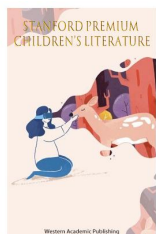
Fiction, New Releases Stanford Premium Children's Literature

鉴于英语写作是国际交流与文化传播的重要手段，而写作能力是中学生英语语言能力与人文素养的综合展现，为了进一步深化中学英语教学改革，提高全国高中生的英语应用能力，培养和发现优秀的英语全面人才，CTVE 现与 Western Academic Publishing WAP (简称 WAP) 西方学术出版社共同举办 2019 年 WAP 海外青少年文学中国区征文活动，并针对以下三本书籍，积极完成期刊征稿及普惠工作