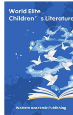
Fiction, New Releases World Elite Children's Literature